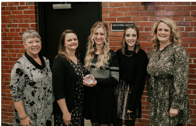
Community National Bank was honored as Business of the Year